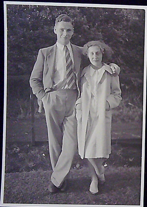
Harington Tennis Club July 1940.