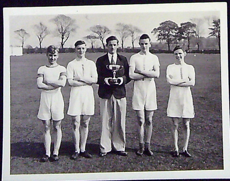
B.G.S. Inter-School Relay Team. Inter-School winners, 1939.