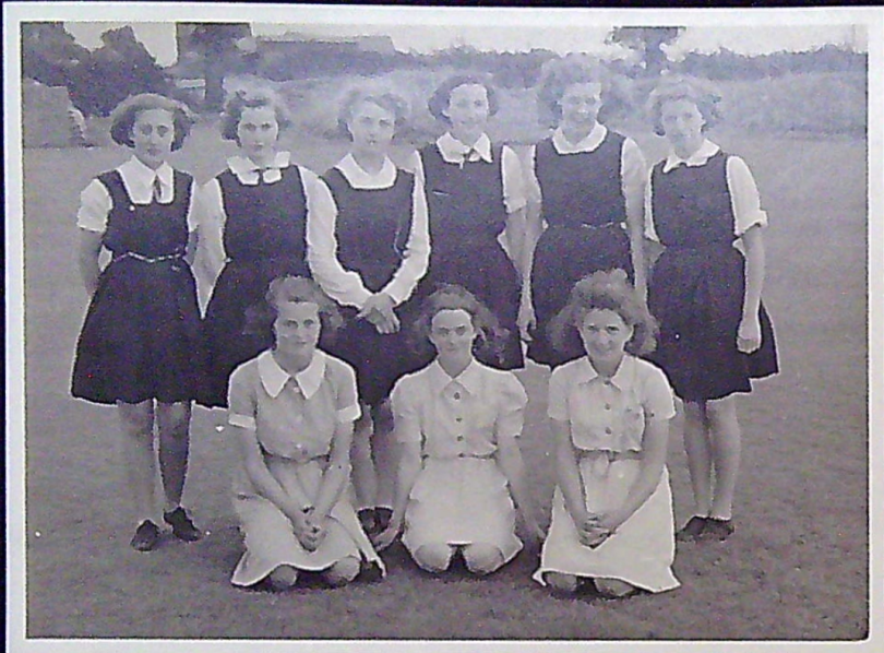
Girls Rounders Team.