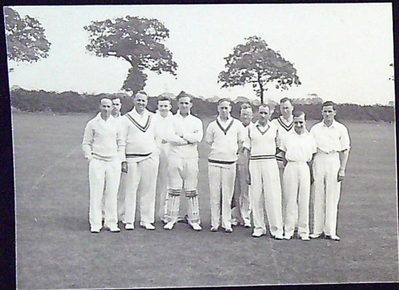
Staff Cricket Team.