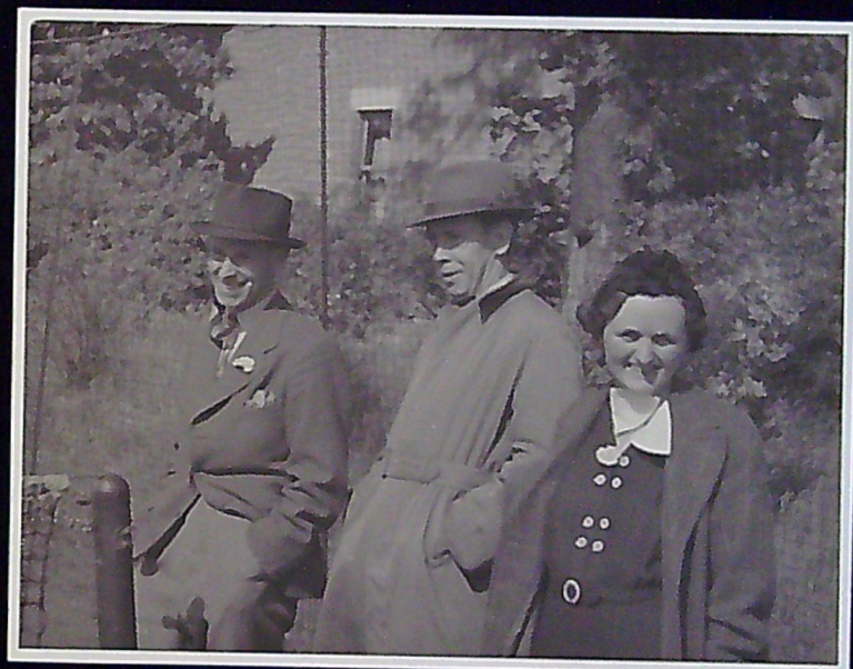
Balshaw's, July 1940.