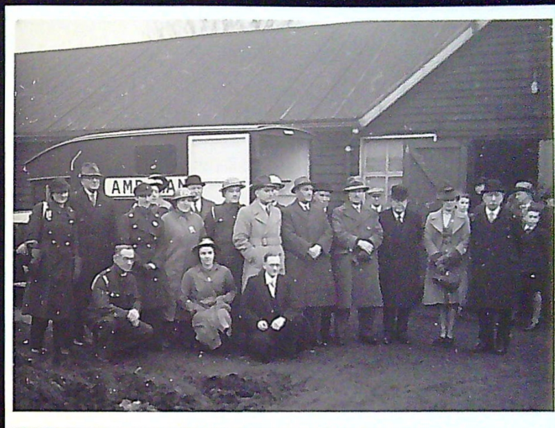
Presentation of Ambulance : Farington F.A.P.