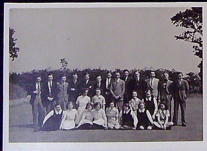
Form V B