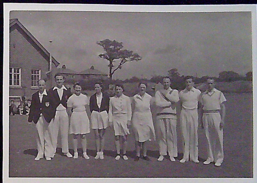
Staff Rounders Team.