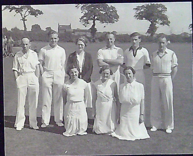
Staff Rounders Team.