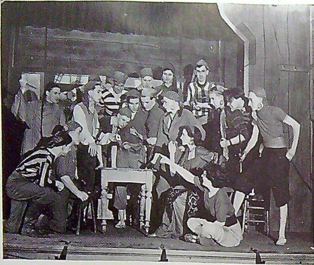
Crew : " Another Ace !" TRANSLATION OF SOPHOCLES' ANTIGONE and " PYGMALION AND GALATEA " (W. S. Gilbert) March 15th, 16th and 17th, 1951.