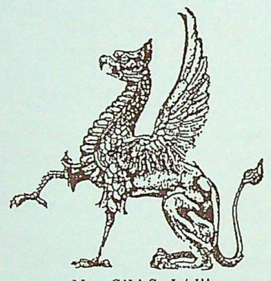
Non Sibi Sed Aliis