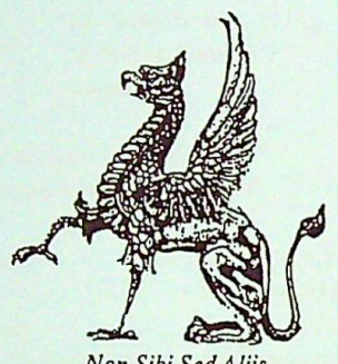
Non Sibi Sed Aliis