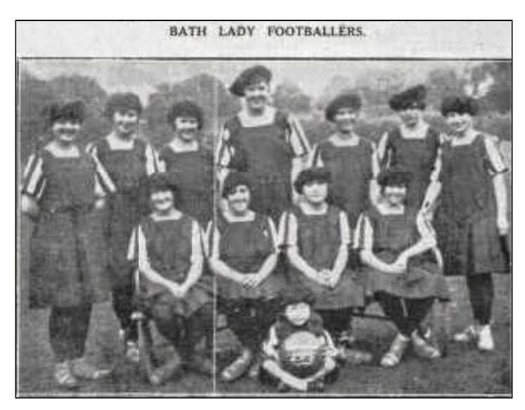
Bath Ladies FC (Guess which player had the nickname 'Tiny'?)