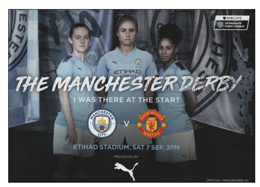
Man City vs Man Utd at the Etihad 2019

"An ex-soldier, his wife, and three children were found in a room, the only furniture consisting of a mattress for them to lie on. They were in a state of starvation. This is an educated man willing to take on any sort of work" (Manchester Guardian - Monday 31st January 1921)